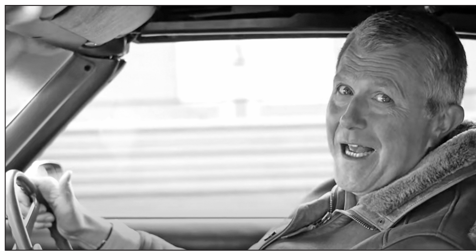
In this image made from video, Republican Kevin Rinke, a former owner of Detroit-area car dealerships, launches his campaign for Michigan governor on Monday, Nov. 22, 2021 in Detroit. Rinke is running for Michigan governor with TV and digital ads touting himself as a conservative outsider and criticizing Gov. Gretchen Whitmer.

Demonstrations in Guadeloupe, an overseas French department of about 400,000 people, erupted over France’s mandatory vaccinations for health care workers and the COVID-19 health pass, required to enter restaurants and many other venues across France. As they degenerated into rioting, an 80-year-old woman was hit by a bullet while on her balcony and at least two others have been injured, according to local authorities. While mainland France has seen similar protests, demonstrators in Guadeloupe are also angry over deep-seated economic, social and racial inequality, and expanded their demands in recent days to include a general salary increase, higher unemployment benefits and the hiring of more teachers. Guadeloupe’s COVID-19 vaccination rate is 33%, compared to 75% nationwide.