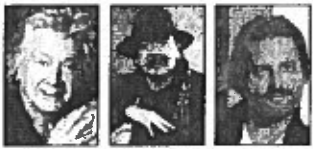
John Lodge 79 Carlos Santana 75 Josh Holloway 53