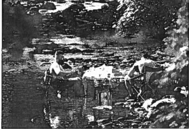
People escape the heatwave by taking a barbecue in a river near the village of Luss in Argyll and Bute on the west bank of Loch Lomond, Scotland, Monday July 18, 2022.