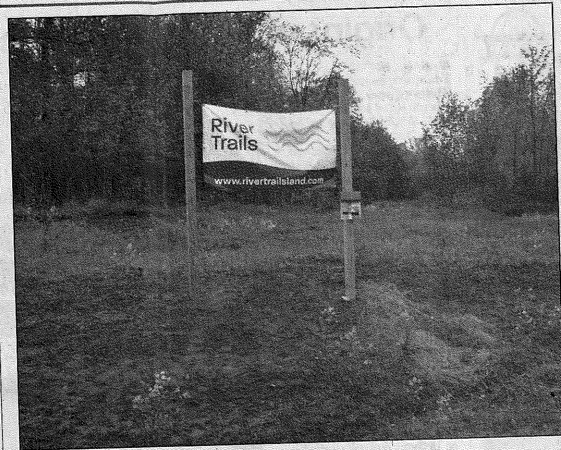
The River Trails project will pursue seven larger lots in a revised first phase after the Department of Environment, Great Lakes and Energy said it would not grant a variance request for elevated levels of uranium found in the groundwater.

In addition to this work, the city has reapplied to EGLE for a $14 million water project and $16 million sewer project. Substantial principal forgiveness would be needed to move