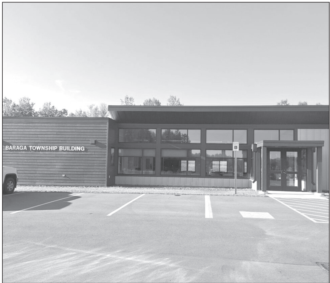
The new Baraga Township Hall on M-38 is pictured.

She also said they are working on getting replacement equipment for the playground, as two of the large slides are damaged. The playground is operable, but some equipment is damaged and not usable.