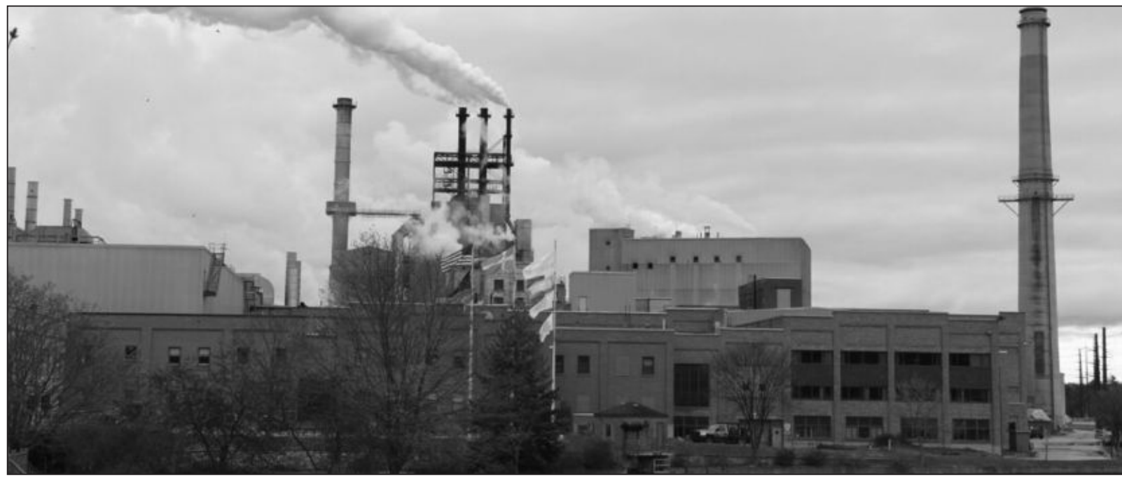
Billerud's Escanaba paper mill is shown. The Swedish company announced plans to convert the mill to produce cartonboard have been scrapped for financial reasons.