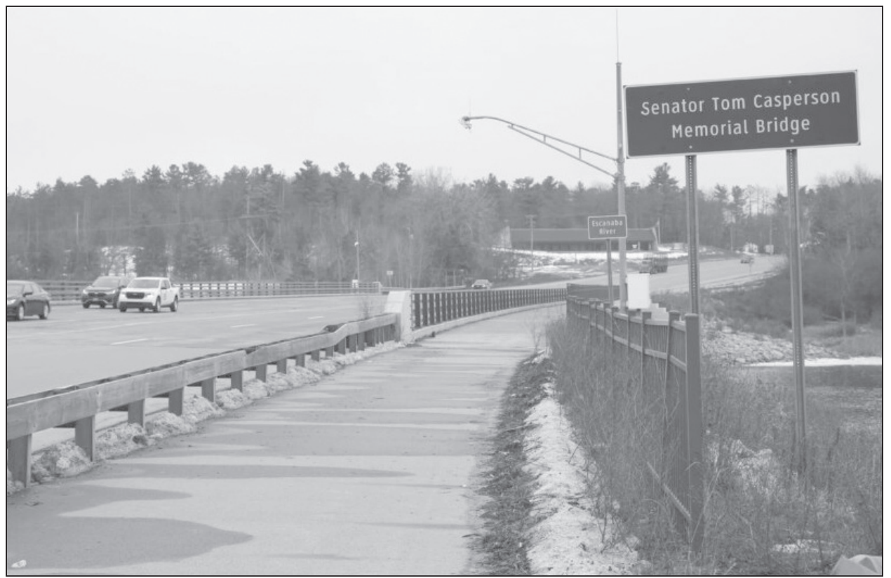
The Senator Tom Casperson Memorial Bridge, which spans over the Escanaba River north of Escanaba, is shown. Work on the bridge is one of the local road and bridge projects planned by the Michigan Department of Transportation over the next several years.