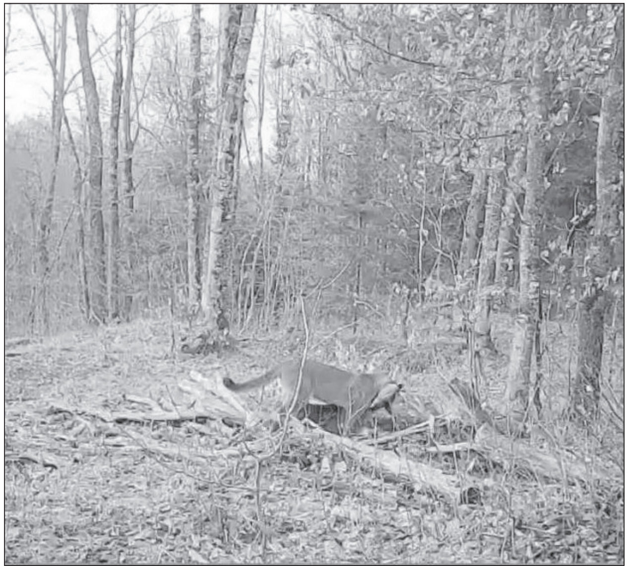
Eli Schaefer captured video of a cougar catching a deer before dragging it away via a camera he had set up at a favorite hunting site near Toivola.

Residents on either list will have to declare a party for the presidential primary. In that case, voters on the permanent ballot list will be sent a form to request the appropriate ballot.