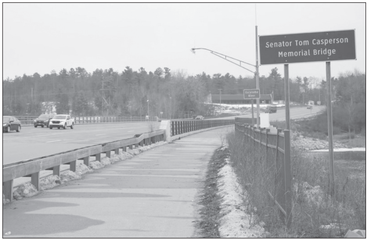
The Senator Tom Casperson Memorial Bridge, which spans over the Escanaba River north of Escanaba, is shown. Work on the bridge is one of the local road and bridge projects planned by the Michigan Department of Transportation over the next several years.