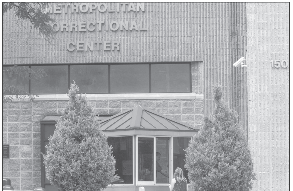
In this Aug. 13, 2019 file photo, an employee checks a visitor outside the Metropolitan Correctional Center in New York. The Justice Department's watchdog said Tuesday that "a combination of negligence and misconduct" enabled Jeffrey Epstein to take his own life at a federal jail in New York City.

The company has reorganized itself into three business units, Ford Model e for electric vehicles, Ford Blue for vehicles with combustion engines and Ford Pro for commercial vehicles.