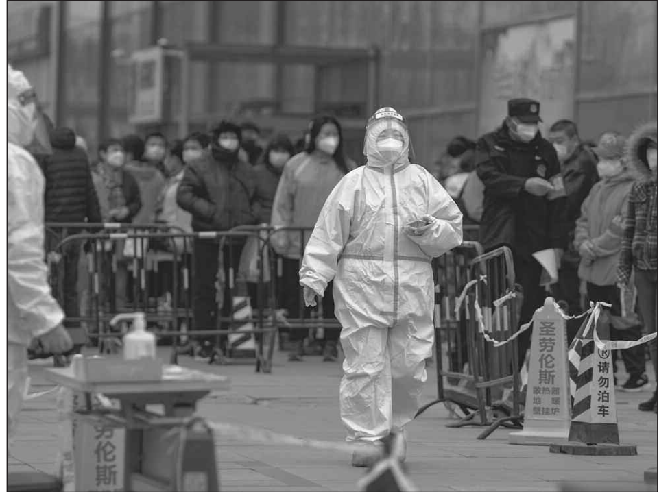
A health worker wearing a protective suit walks by masked residents who wait in line to get their throat swab at a coronavirus testing site following a COVID-19 case being detected in a residential building on Wednesday in Beijing.

Jones said in a video on the Infowars website that the deposition began Tuesday and was to continue Wednesday. He said in the video that the families' lawyers began the deposition by "demonizing" him for his questioning official versions of events.