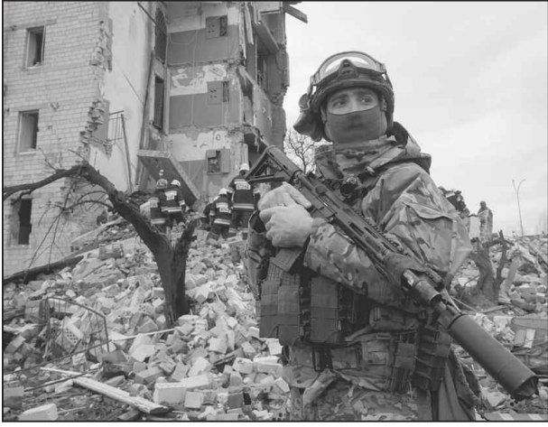
A Ukrainian soldier stands against the background of an apartment house ruined in the Russian shelling in Borodyanka, Ukraine, Wednesday.