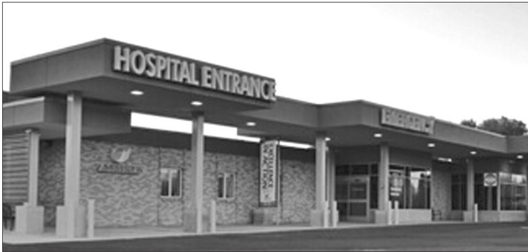
Ontonagon Hospital's emergency entrance is shown.